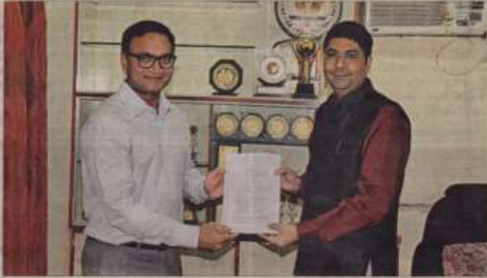
ભાગલાલ, ૨૩ ડિસેમ્બર, ૨૦૧૫